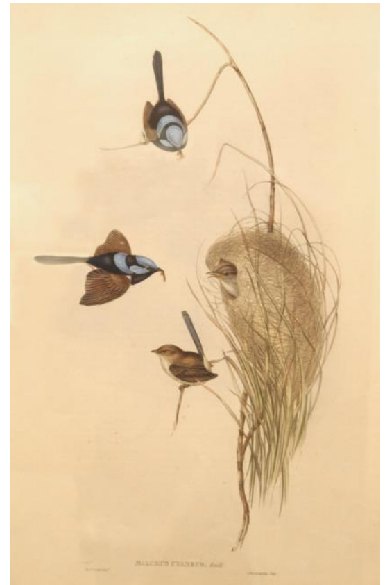
Illustration by Elizabeth Gould

We do need to give the museum a ballpark on how many plan to attend. Please RSVP if you are coming and how many are in your party. knoxbirds@gmail.com