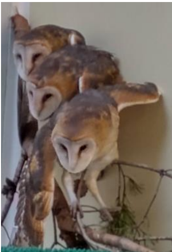
Barn Owls Before Release