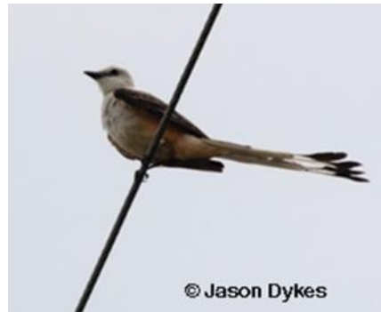
Scissor-tailed Flycatcher observed on a KTOS fieldtrip to Sequatchie Valley.

Meet at the beginning of the Parkway in Walland at 8:00 a.m. for fall migrants, or at the first double-sided pull-off up the Parkway at about 9:30 a.m.. We will probably be done before noon.