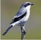
Loggerhead Shrike.