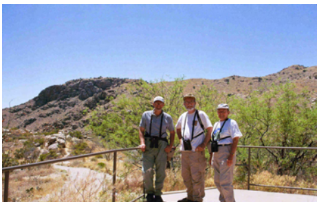
Mt. Lemon - 2005 Arizona Trip