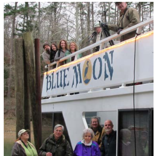
Happy KTOS members aboard the Blue Moon Cruise boat on February 18, 2012.

Species seen: Snow/Ross's Goose 1 (not confirmed as to species); Canada Goose 30; Gadwall 35; American Black Duck 4; Mallard 600; Northern Pintail 2; Green-winged Teal 40; Red-head 1; Ring-necked Duck 1; Buffle-head 25; Hooded Merganser 10; Pied-billed Grebe 12; Horned Grebe 18; Double-crested Cormorant 200; Great Blue Heron 60; Black Vulture 1; Turkey Vulture 8; Osprey 1; Bald Eagle 15; American Coot 70; Sandhill Crane 2500; Whooping Crane 2; Killdeer 30; Ring-billed Gull 400; Rock Pigeon 40; Belted Kingfisher 5; Red-bellied Woodpecker 1; American Crow 20; Carolina Chickadee 1; and Tufted Titmouse 1.