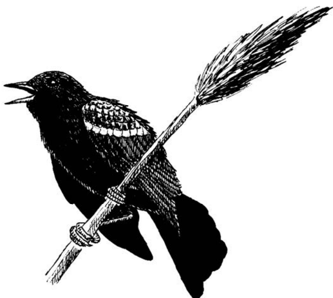
Red-winged Blackbird, Steven D'Amato.