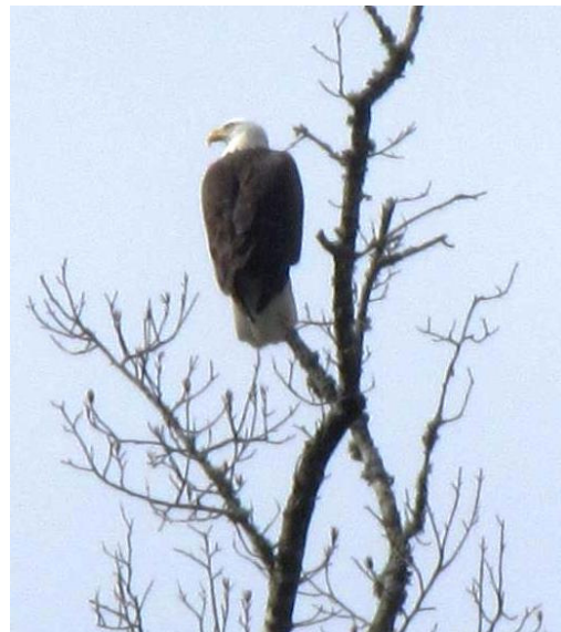
One of the adult Bald Eagles seen along the French Broad River on February 15.