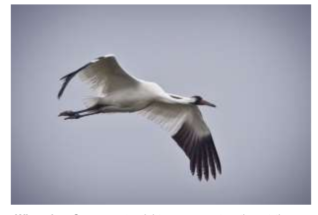
Whooping Crane, up to eight were seen together at the recent TOS Winter Meeting at Wheeler National Wildlife Refuge in Decatur, Ala on 24 January 2016.

Participants will tally the number of individual birds of each species they see during their count period. The data will be entered by each participant at the GBBC website. For additional information please visit <a href="mailto:gbbc.birdcount.org">gbbc.birdcount.org</a>.