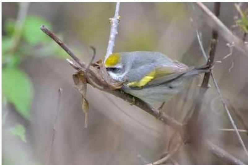
Golden-winged Warbler . Source: By Andrew C (Golden-Winged Warbler (Vermivora chrysoptera)) [CC BY 2.0 (<u>creativecommons.org/licenses/by/2.0</u>)], via Wikimedia Commons

Please welcome the following new member: Rose Thorn.