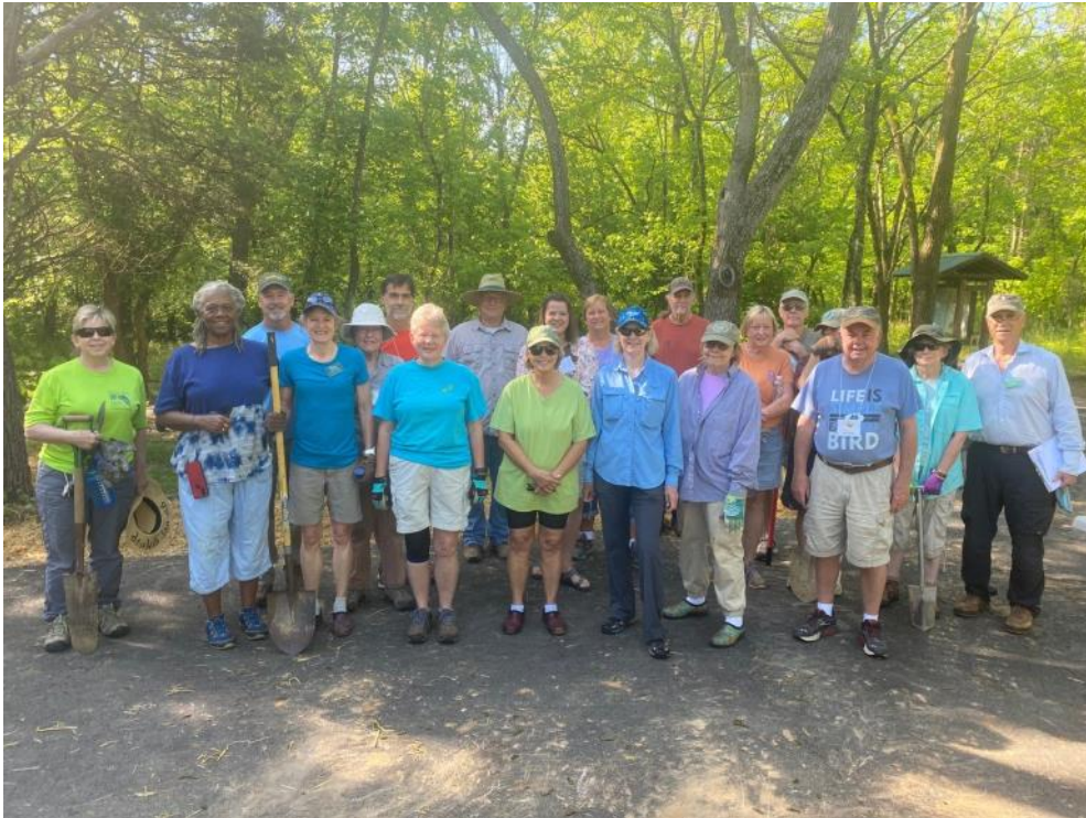
KTOS and Knoxville Master Gardeners planting a native garden at Collier Preserve

Even though the summer has been pretty slow for birdwatching, KTOS has still been active with several conservation and educational projects. In June, KTOS partnered with the Knoxville Master Gardeners and put in a native plant garden at Collier Preserve. KTOS gave $1,000 to purchase plants that came out of the Marsha Davis and J B Owen Funds for 2020. On planting day around ten KTOS members showed up to help plant shrubs and small bushes. We hope to use this project to continue to educate the public about the benefits that native plants have to birds. Doc Collier would be proud.