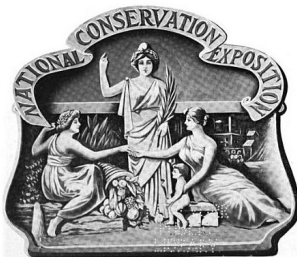
Seal from 1913 National Conservation Exposition held in Knoxville.