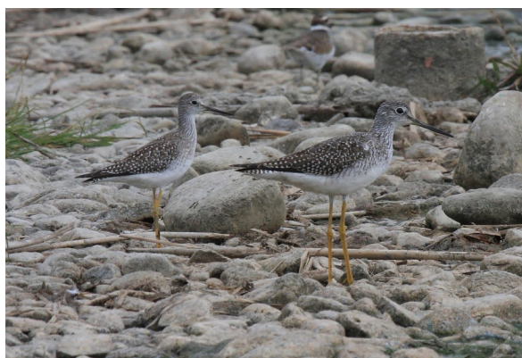
Greater and Lesser Yellowlegs

We will meet at the Foothills Parkway turnaround at the beginning of road in Walland, Tenn. at 8:00 a.m. We will start our trip by looking for migrants around the parking lot such as Hermit, Grey-cheeked, and Swainson's Thrushes with some confusing fall warblers. We will then move to higher