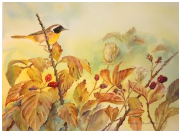
"Common Yellowthroat at Seven Islands" by Vickie Henderson.

KTOS 2014 dues are $26 (individual), $30 (family), $38 (sustaining), $13 (student), $8 (TOS life members). TOS life membership is $450. A KTOS membership form is available at http://tinyurl.com/9gjss2f .