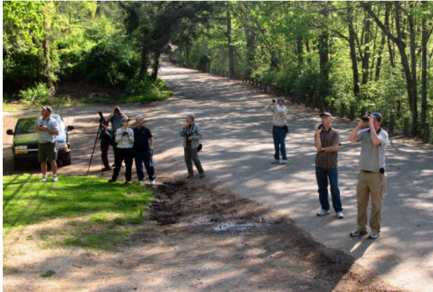
Birders on Sharp's Ridge - April 2009