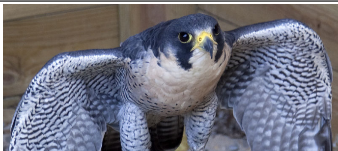
Peregrine Falcon.