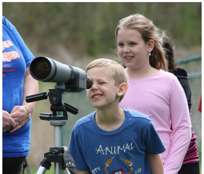
Students at Sevierville Primary School