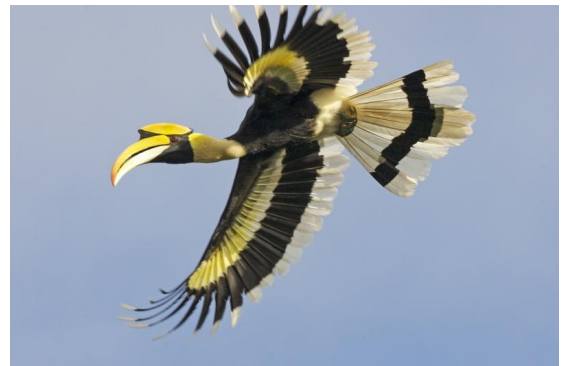
Great Hornbill, a near-threatened species in Bhutan