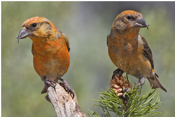
Red Crossbills, a resident in Tennessee.