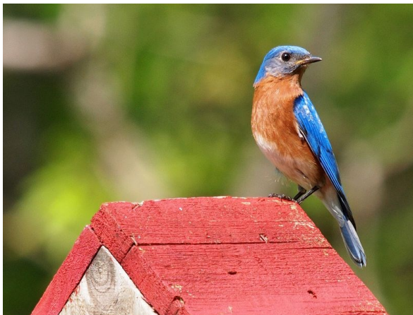
Eastern Bluebird, Source: Wikimedia Commons

Information will be provided by Billie Cantwell who has monitored Seven Islands’ Bluebird trail for the past 5 years.