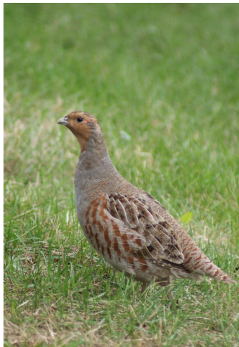
English Partridge

Assuming that the song is only discussing birds that are indigenous to England, some of the species can be determined. The partridge in the song could refer to the "English Partridge" (Grey Partridge) or the introduced "French Partridge" (Red-legged Partridge). The collie bird is the European Blackbird, based on collie meaning as black as coal. There are numerous swan species that could be present in England, but the only all year around wild resident is the Mute Swan. Michael J. Plaster