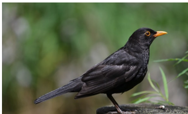
European Blackbird