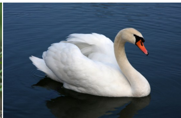
Mute Swan