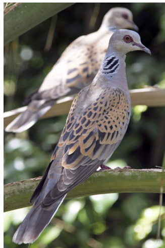
Turtle Dove