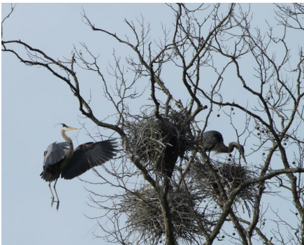
Great Blue Herons.