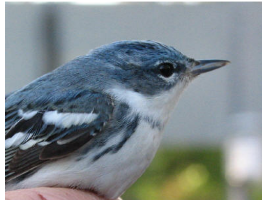
at a banding session in Ft. Morgan, AL.

Please go to http://avianpursuits.com/ and click on " BioBlitz " for more information about this event, including a schedule of field trips.